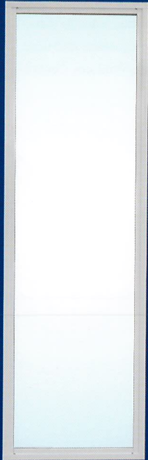
Fixed – Eco-Guard 300 Series