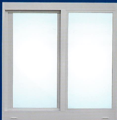
Horizontal Rolling Window - Eco-Guard 200 Series