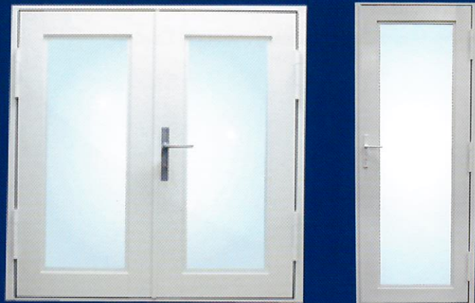
Single or Double French Door - Eco-Guard 600 Series